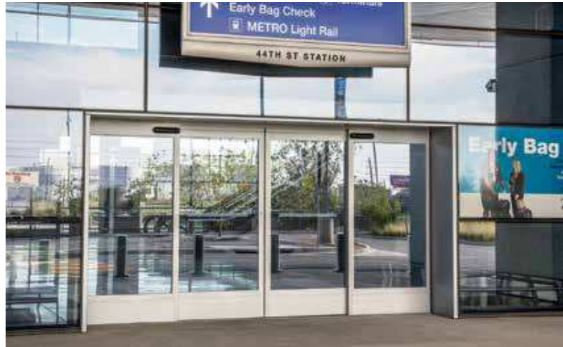
ESA300 PHX Sky Train – Phoenix, AZ Architect: HOK