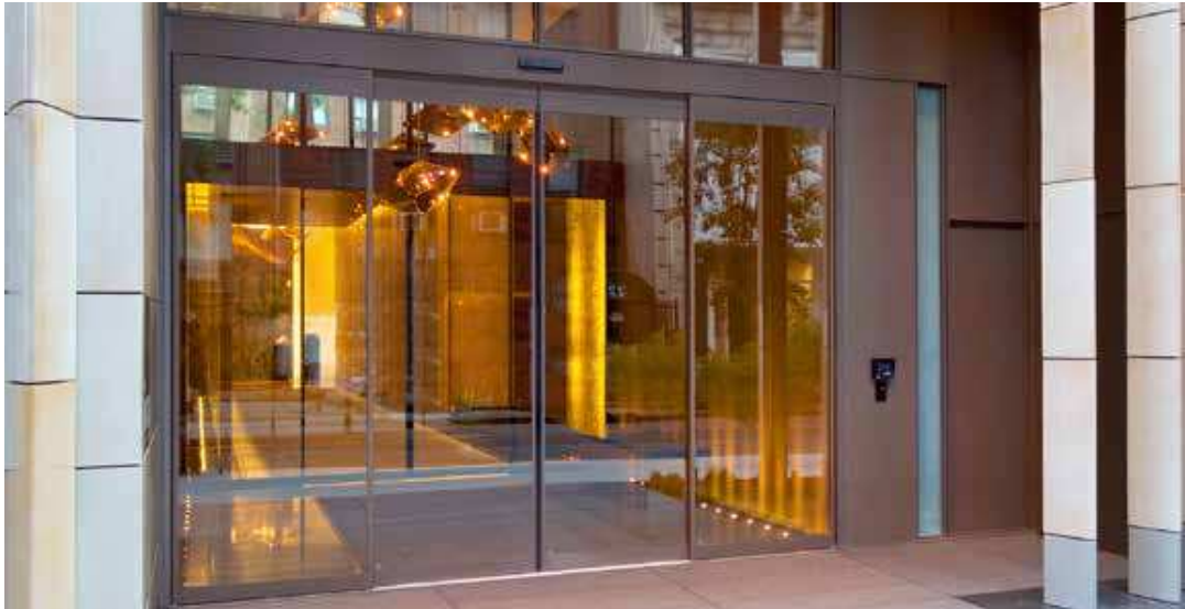
ESA400 Fine Frame 1 Madison Avenue – New York, NY