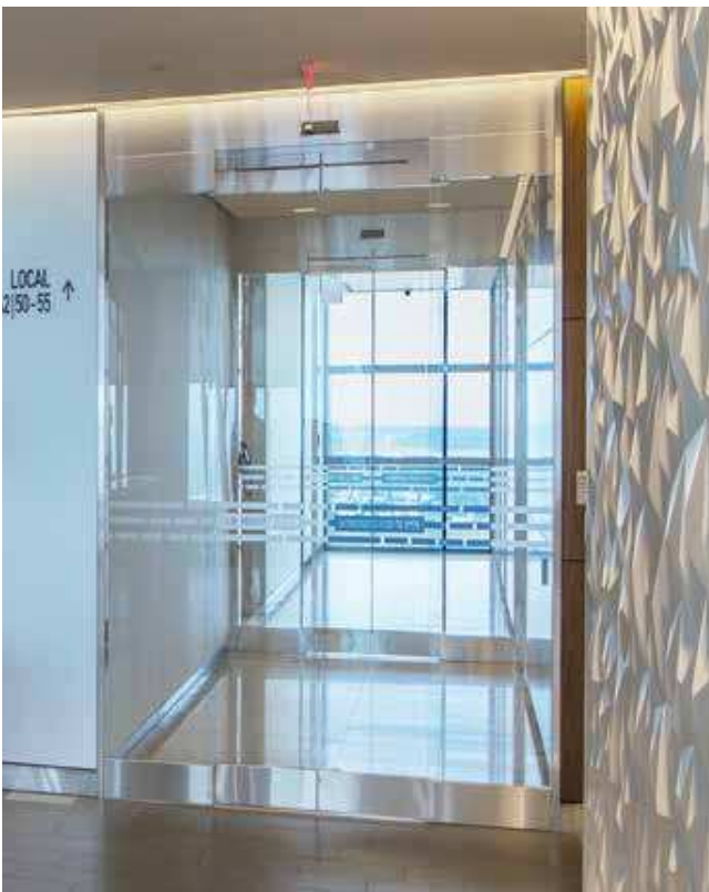
The Bow Office Tower – Calgary, Alberta Architect: Gensler