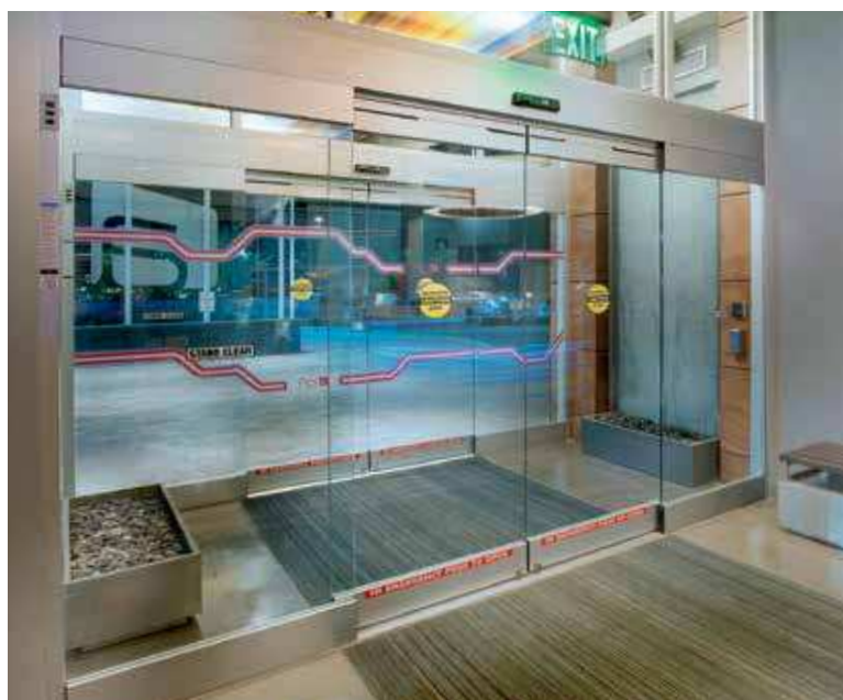
Aloft Detroit at The David Whitney – Detroit, MI Architect: Kraemer Design Group PLC