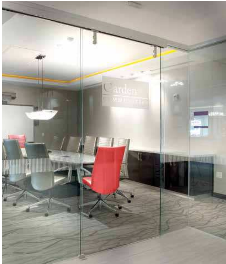
Garden Communities – San Diego, CA