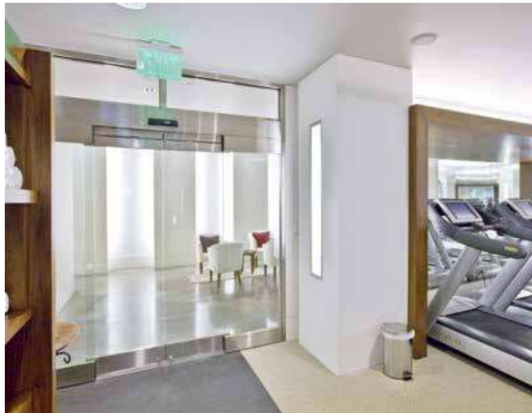
MGM Grand Casino Hotel – Detroit, MI