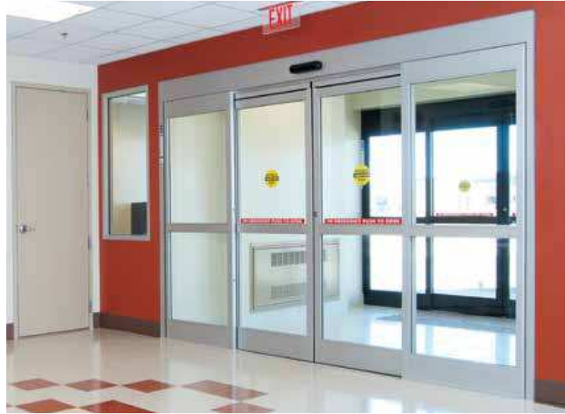
ESA200 Little Colorado Medical Center – Winslow, AZ Architect: Mittelstaedt, Cooper & Associates

dormakaba ESA doors couple rugged door panel construction with a smart design. Our uniform glass stops are designed to maintain consistent sightlines and daylight openings from door panel to door panel. This ensures that sliders using different glass within a vestibule will maintain the same daylight openings.