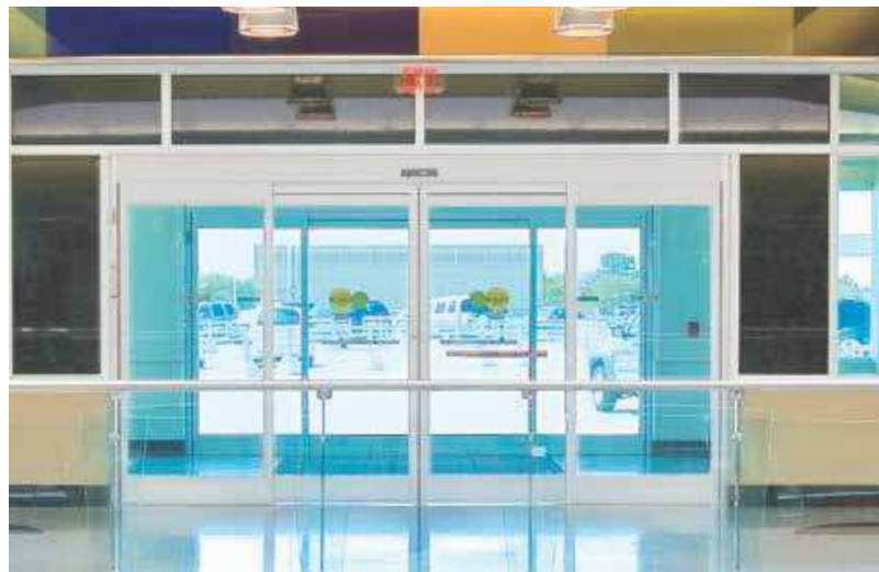
ESA200 Kansas City International Airport – Kansas City, MO