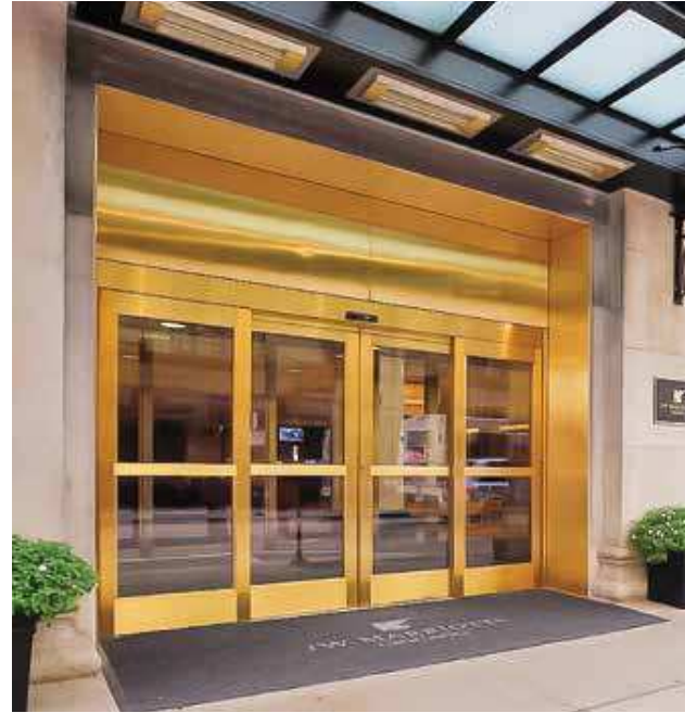
ESA300 with Clad Bronze Finish JW Marriott Chicago – Chicago, IL Architect: Lucien Lagrange & Assoc.

We couple modern technology with old world craftsmanship to manufacture the finest architectural finishes of any manufacturer.