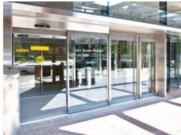
The already stylish ESA400 Fine Frame and ESA500 All Glass doors make elegant entrances when clad in a dormakaba ornamental architectural finish. (Brushed stainless steel cladding shown above.)