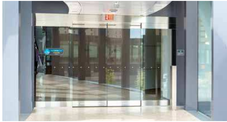
The Bow Office Tower – Calgary, Alberta Architect: Gensler

The ESA500 has a five-function program switch, adjustable motion sensor, and optional self-closing side panels.